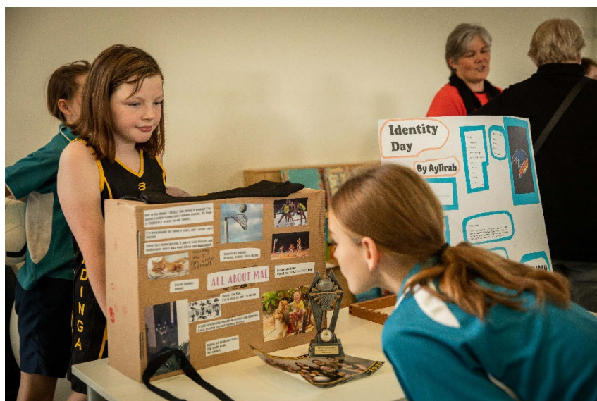
Photo: Year 6 Identity Day