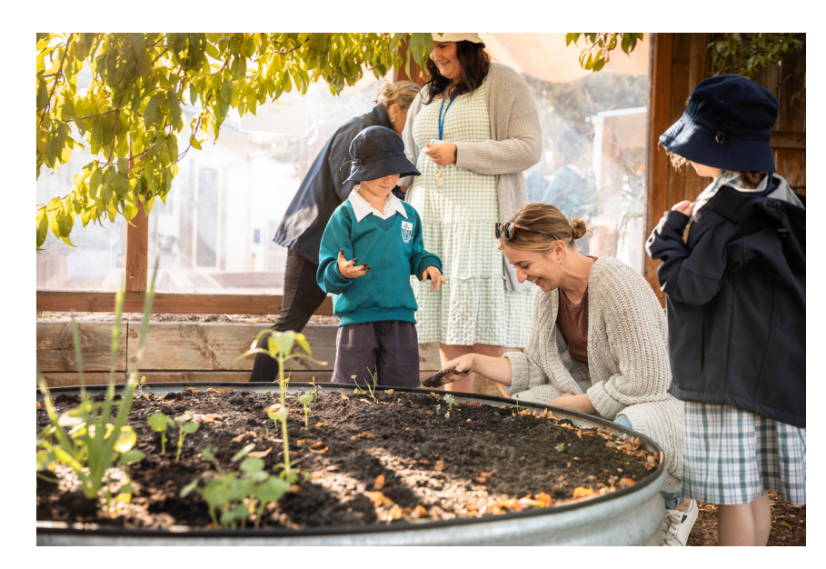
Students and parent helpers planting in the Secret Garden

Mon 13 - Thu 16 May Learning Conversations